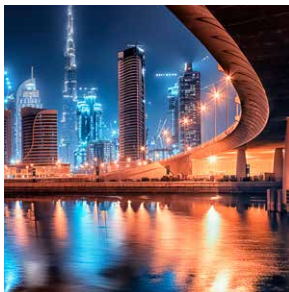
YOUR OWN VISUAL