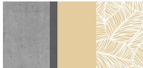
WALLS FROM STOCK

A strong visual is a decisive element of any set-up. You can opt for an attractive FLEXX visual or a visual of your own choice.