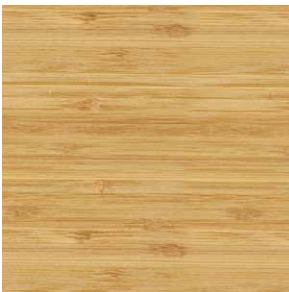
...TO WOOD LAMINATE FLOORING