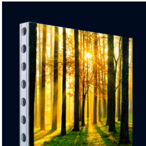
PRINT WITH BACKLIT LED